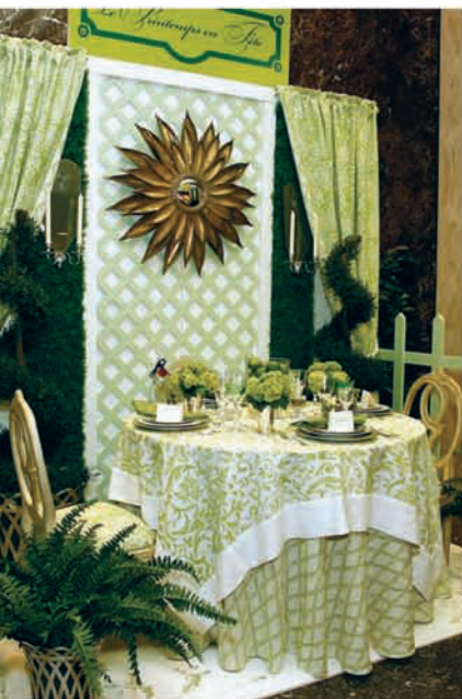
"Lunch in the Italian Garden," one of three lobby vignettes seen at 41 Madison , mixed tableware from the building's tenants with fabrics and tablecloths from JA Design Studio, China Seas and Quadrille.

ed his "jewelry for the table" — dishwasher-safe and food-safe tableware ensembles finished with 22k gold or platinum, stainless flatware, and the Porcelain Collection (handmade in the United States). Notables included the Truro, Monterey and Manhattan Collections.